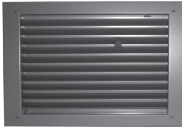
1100A Photo & Drawing

Manually-Operated Adjustable Louver for Doors, Transoms and Partitions